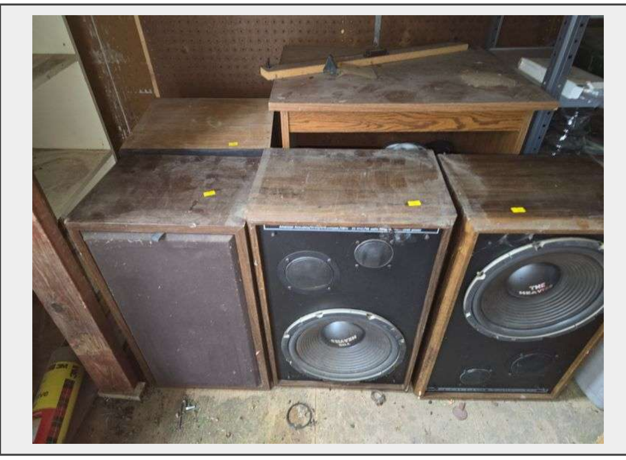
Lot Location Out Building

LOT 396 - Pair of American Acoustics Speakers "The Heavies"